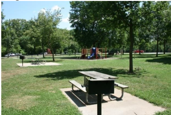
Picnic and playground area at Round Springs

Missouri Springs offer some of the most beautiful scenery found anywhere in the state. Each Spring has its own unique identity, yet they all seem connected by secret underground passageways. The drive to the various Springs are on the scenic Missouri back roads, an added delight to the adventure!